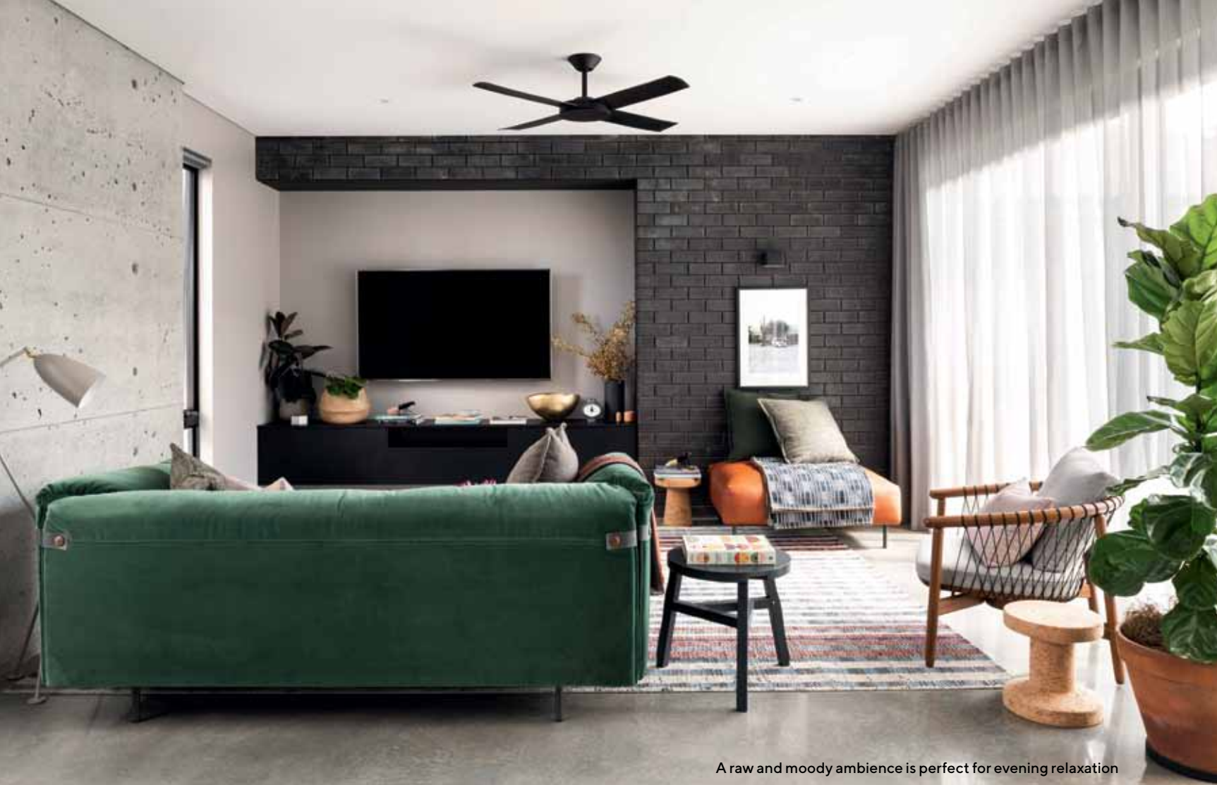
A raw and moody ambience is perfect for evening relaxation