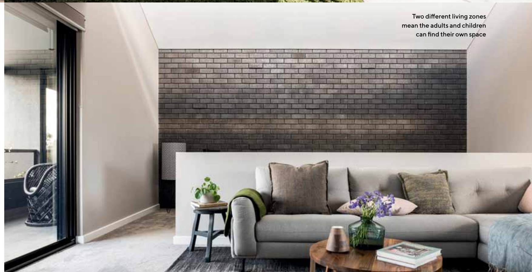
Two different living zones mean the adults and children can find their own space

Perhaps the owners say it best: "The visual appeal and function of waking up in a home with so much variety and spaces that flow so well is truly enjoyable." 🏡