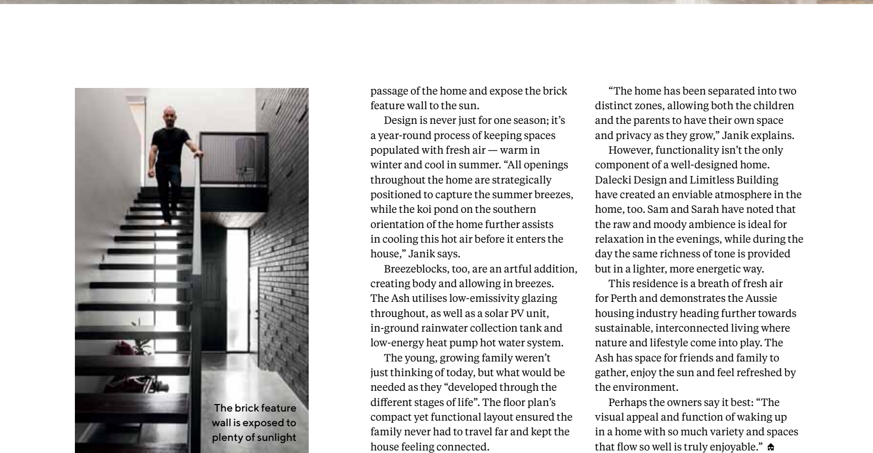
The brick feature wall is exposed to plenty of sunlight

passage of the home and expose the brick feature wall to the sun.