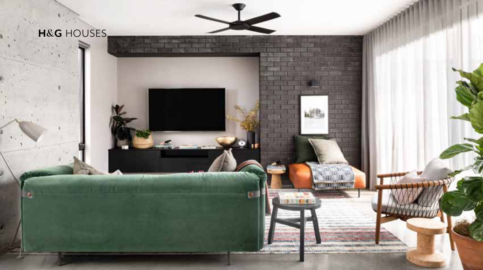
LIVING Dark brickwork and concrete inspired the moody sophistication of the interiors. 'Crosshatch' chair, Living Edge. Ottoman, Ultimo Interiors. Throw (on ottoman), Editeur. Rug, Temple Fine Rugs. Artwork by Meghan Plowman. Lucci Air 'Aero' fan, Beacon Lighting. Smart buy: 'Elements' bricks in Zinc, from $1760/1000, Austral Bricks. STAIRS Mya climbs treads in jarrah recycled from the roof structure of the old house. George Nelson bench, Living Edge. POOLSIDE Concrete breezeblocks soften the harsh western sun and create an eye-catching shadowplay. Vitra 'Belleville' table and chairs, Living Edge.